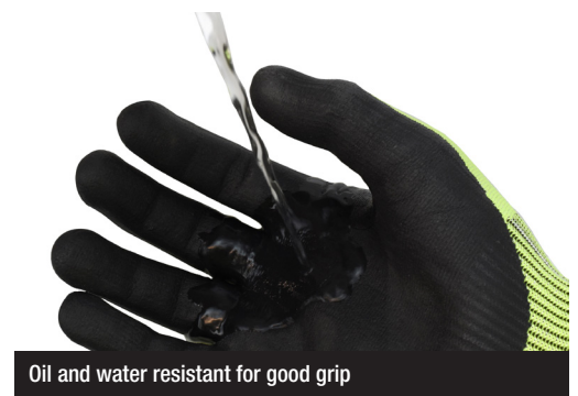
Oil and water resistant for good grip