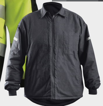
WEARABLE FLANNEL JACKET

HQ / EASTERN WAREHOUSE 585-52 North Bicycle Path Port Jefferson Station, NY 11776