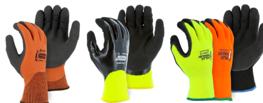
3398DLO 3398DNY 3396 Series